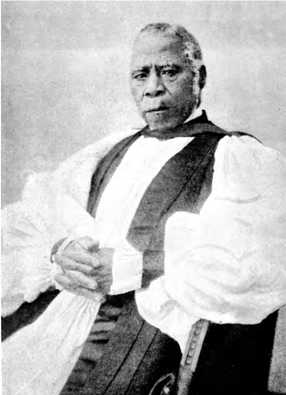
13. Samuel Adjai Crowther, first black bishop in the Anglican Communion

leadership. A small group of well-educated local clergy, some of whom had adopted English names, were later to be central in the missionary movements along the Niger River. Many retained knowledge of their African language, which allowed them easier contact with the local population. Central to Venn's strategy of 'a native church under native pastors and a native episcopate' was Samuel Crowther (Figure 13), ordained in 1843, who opened the first mission station in the Niger Delta in 1845.